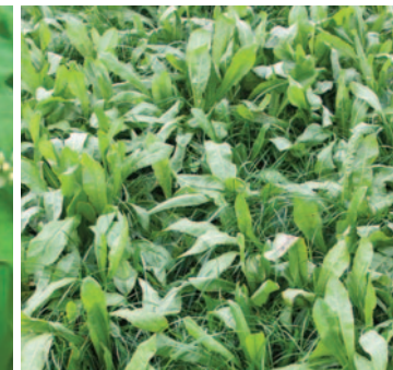
Chicory in grass